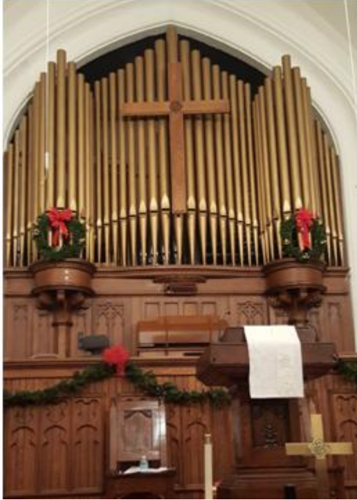
Decorating for the greatest time of the year!

Invite FRANK to our Advent & Christmas worship services & activities (Friends, Relatives, Acquaintances, Neighbors & Kids)