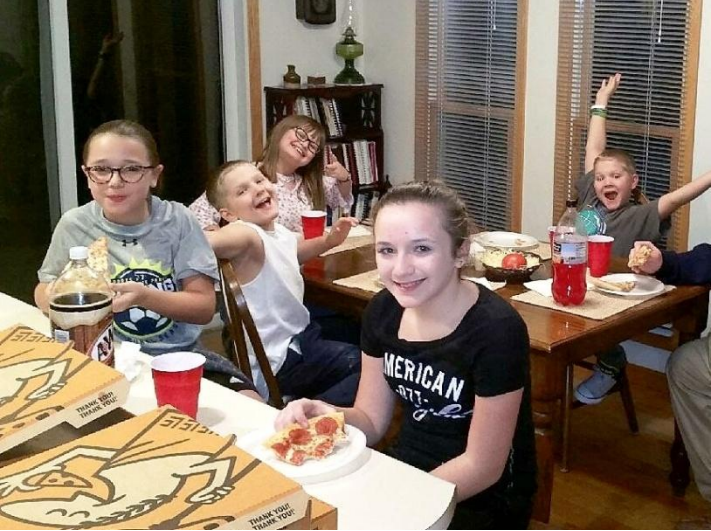
Mid Highs meeting at McDowell home to eat pizza and make pottery