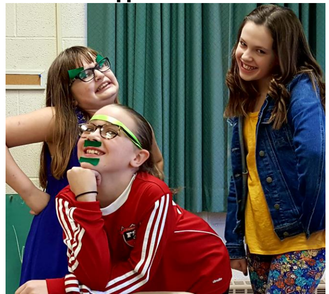
Mid High Youth-Crazy Fun!

MID-HIGH YOUTH GROUP All 5 th to 8 th Graders are invited to Mid-High Youth Group – April 15 and April 29 6 – 7:15 pm in the youth room Supper included!