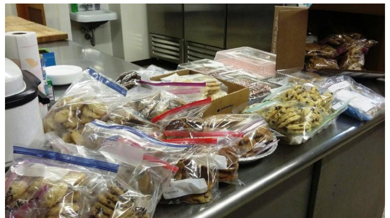
Evening Circle assembles toiletries bags