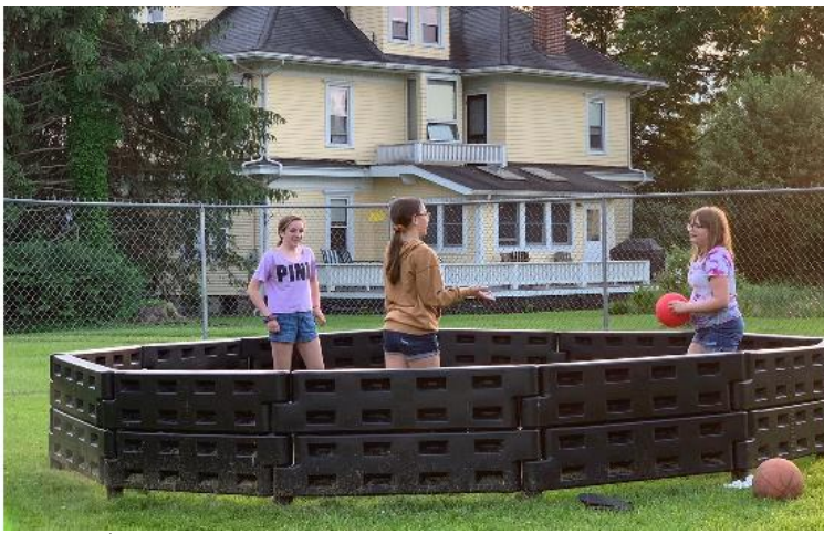
Mid High Youth play "Gaga" at the FUMC Playground