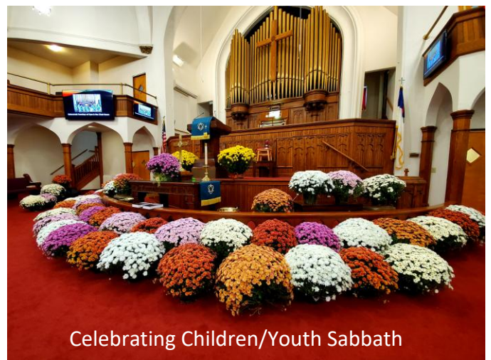
Celebrating Children/Youth Sabbath