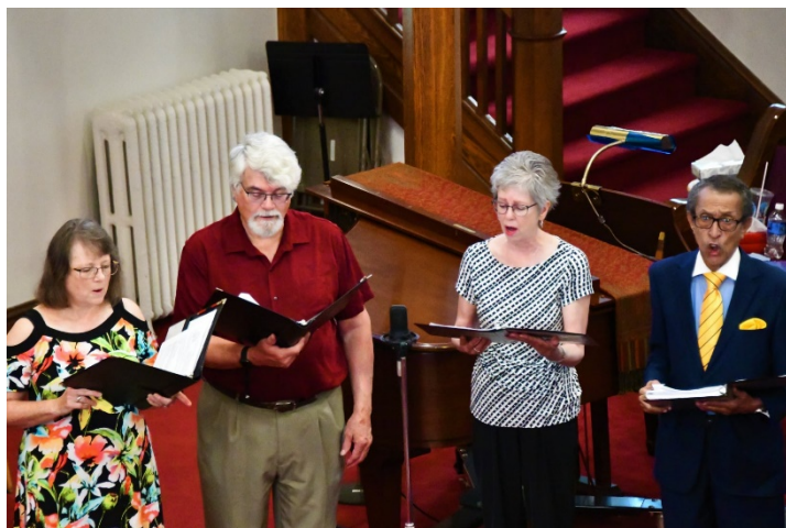
Thanks and appreciation to our Musicians!

The Micah Outreach Ministry Team encourages you to continue your support of the Upshur Parish House. The Collection of the Month for August is “bar soap, powdered laundry detergent, bathroom tissue, and garden vegetables.” You may leave your donations in Linger Hall if you attend Sunday Worship, or leave your donations on the Front Porch of the Parish House, 68 College Ave.