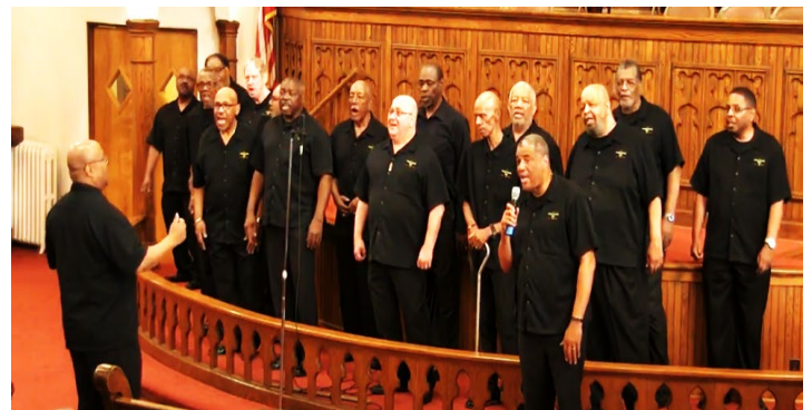
Martin Luther King Jr. Chorus Performing at FUMC On May 21, 2023