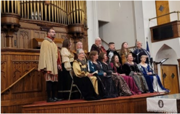
Madrigal Singers performing on May 1