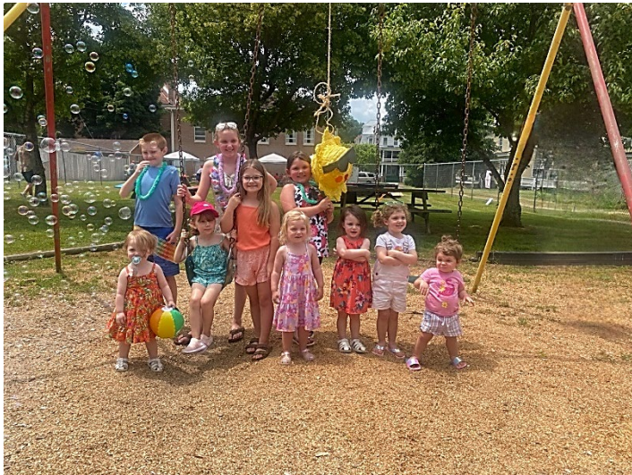
It's fun in the sun time for FUMC children during Beach Sunday picnic!