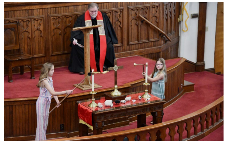
Acolytes in morning worship service Help create a family based intergenerational church

Our theme emerged out of a reading from Isaiah 52:7-12. In Isaiah the people of God had been through a traumatic event, and, coming out of it, wanted to know what came next. Isaiah gives the people a vision—they are to proclaim peace and bring good news.