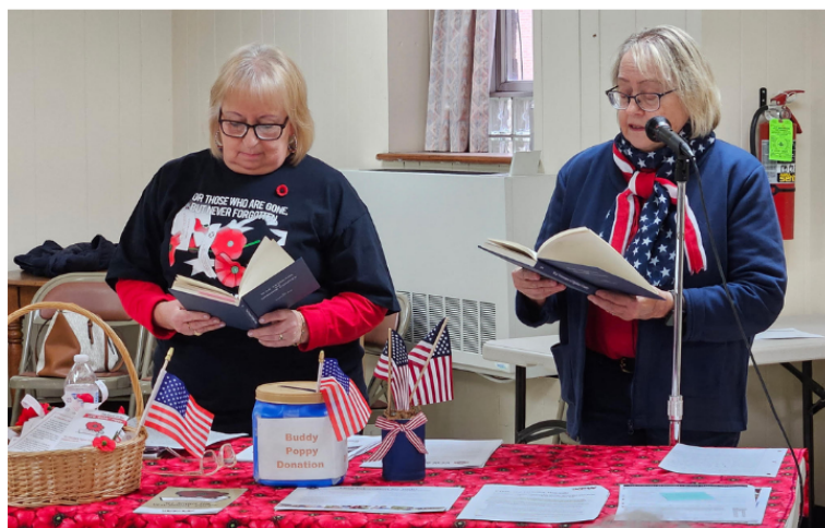
LEFT: NAN AND FRIEND TELL ABOUT BUDDY POPPIES.